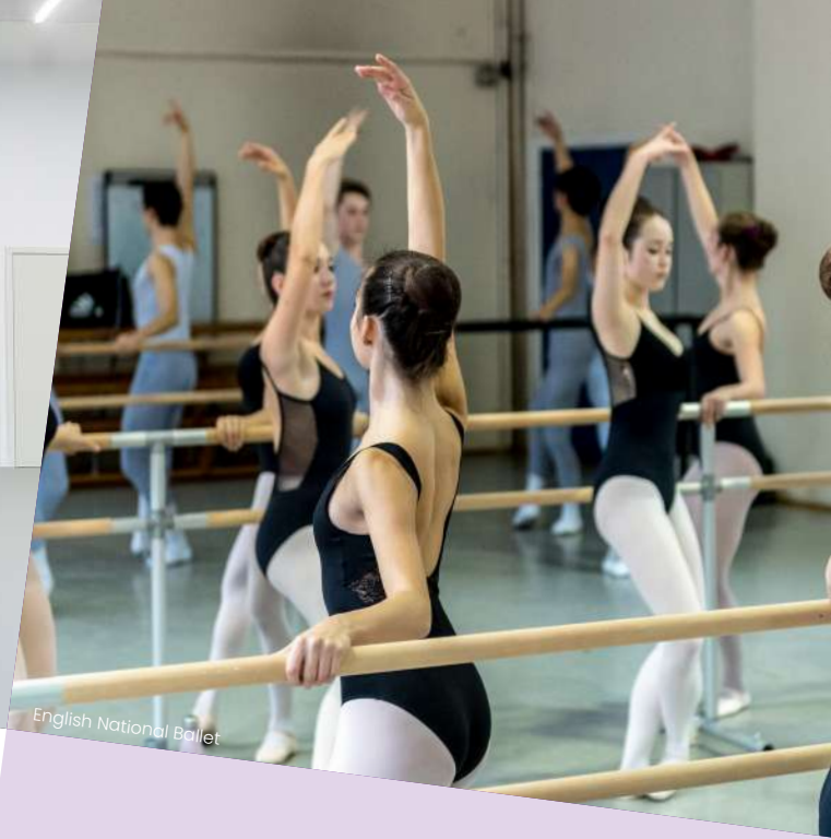
English National Ballet