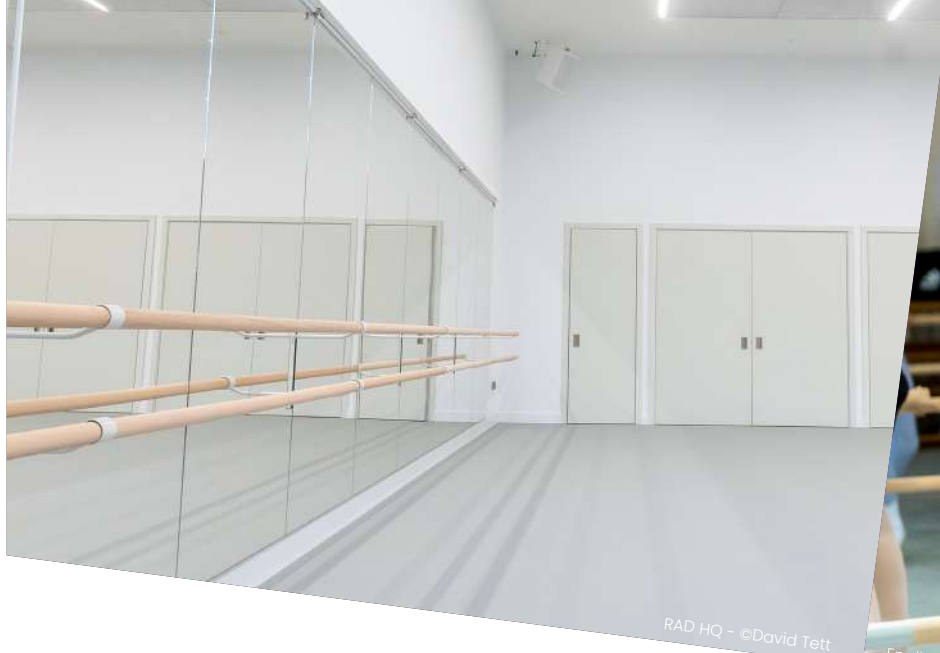
RAD HQ