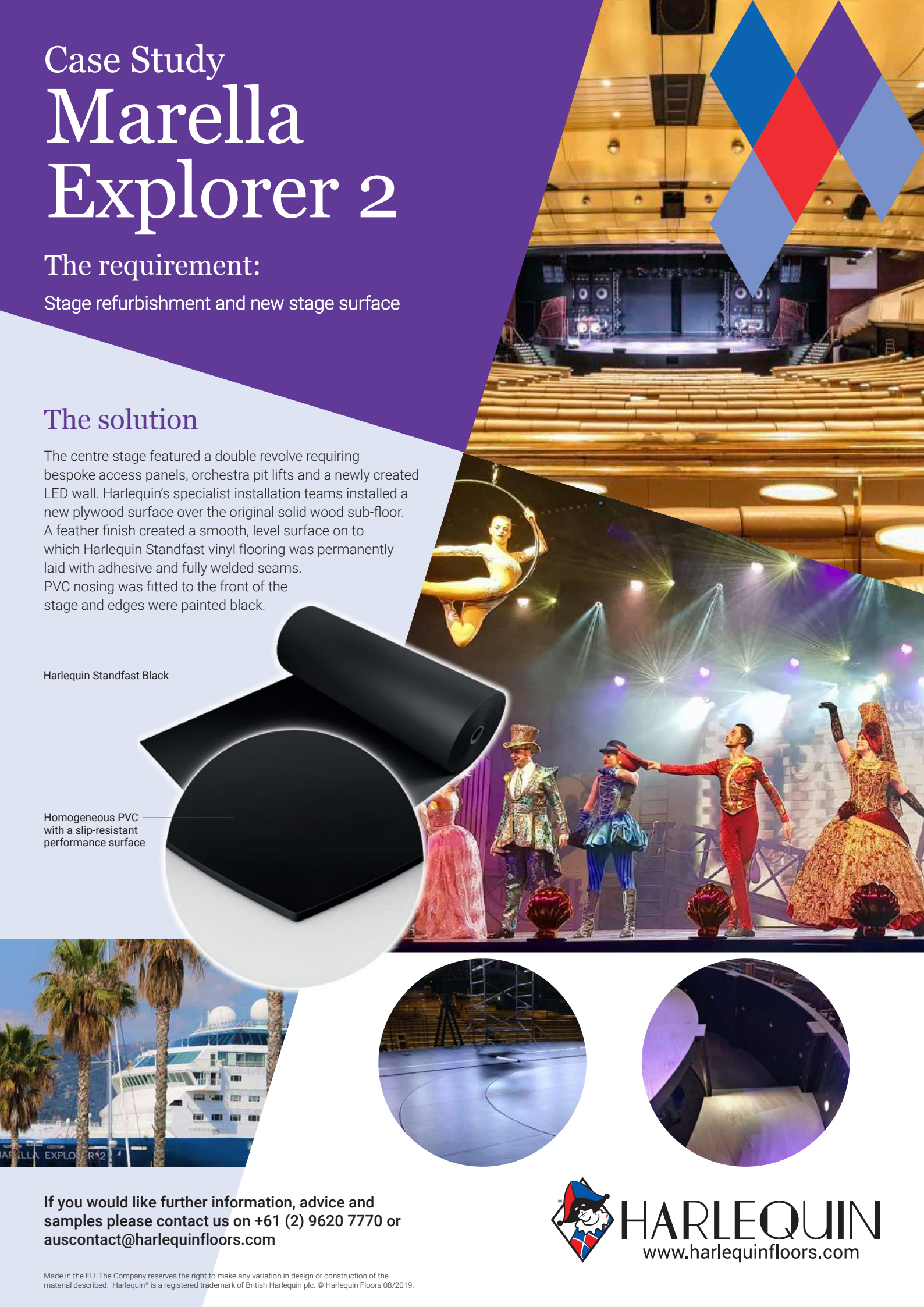
Homogeneous PVC with a slip-resistant performance surface

If you would like further information, advice and samples please contact us on +61 (2) 9620 7770 or auscontact@harlequinfloors.com