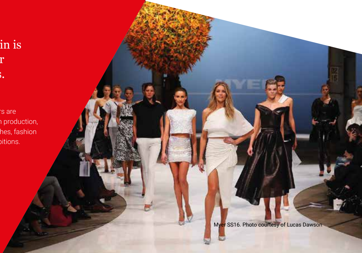
Myer SS16.

Harlequin's event and display floors are the industry choice for TV and film production, concerts and tours, product launches, fashion shows, window displays and exhibitions.