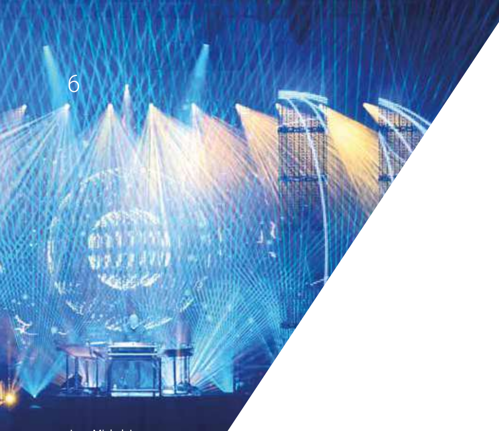
Jean-Michel Jarre, live tour 2016. Harlequin Reversible black/grey