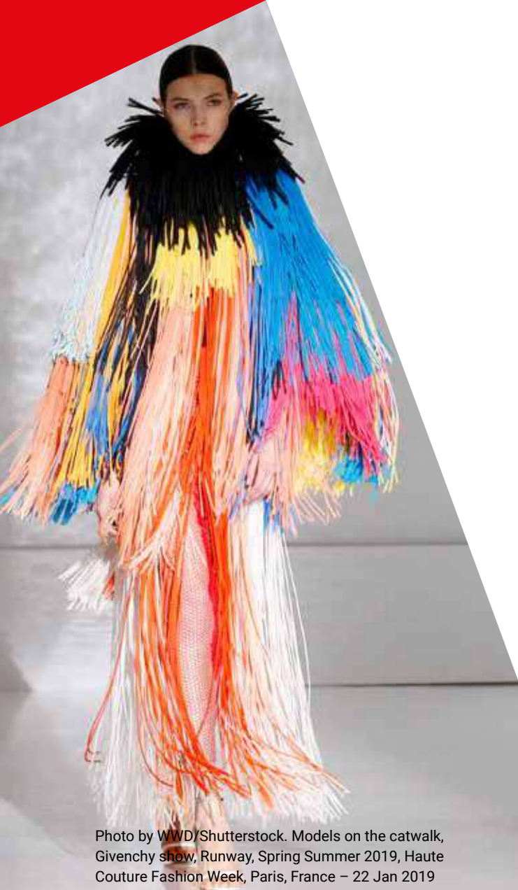
Models on the catwalk, Givenchy show, Runway, Spring Summer 2019, Haute Couture Fashion Week, Paris, France – 22 Jan 2019