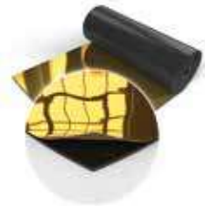
Gold - 050