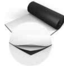
Black/White - 001