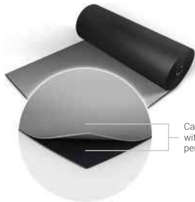
Calendared vinyl with a slip-resistant performance surface