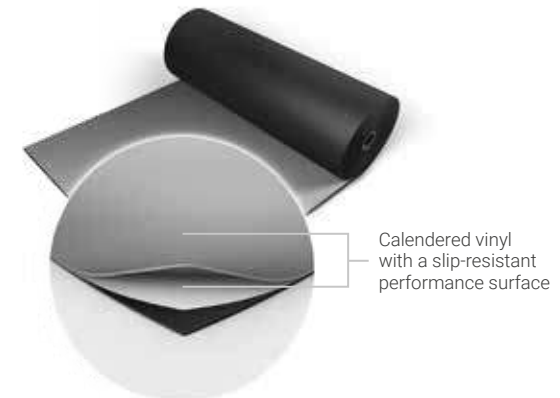
Projection Grey/Black - 005

Harlequin's Reversible Black/Projection Grey vinyl absorbs ambient light and delivers a more vivid projection of images on to the vinyl surface. Contrast ratios are enhanced, ensuring less light bleed and less unwanted reflective light. As the leading product on the market for peak gain measurement, Harlequin's Projection Grey provides higher brightness and a wider viewing angle for audiences, through front projection. This is a practical solution for film, TV and theatre production.