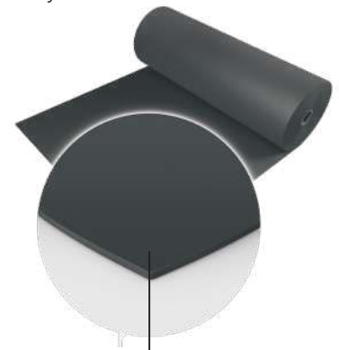
Homogeneous vinyl with a slip-resistant performance surface