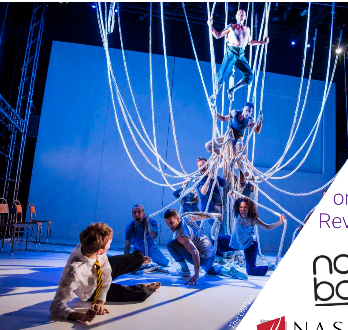
The Old Vic