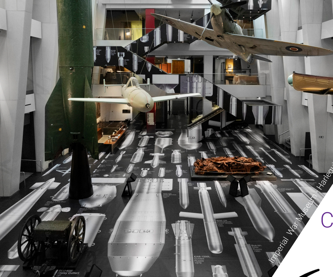
Imperial War Museum - Harlequin Clarity Printed