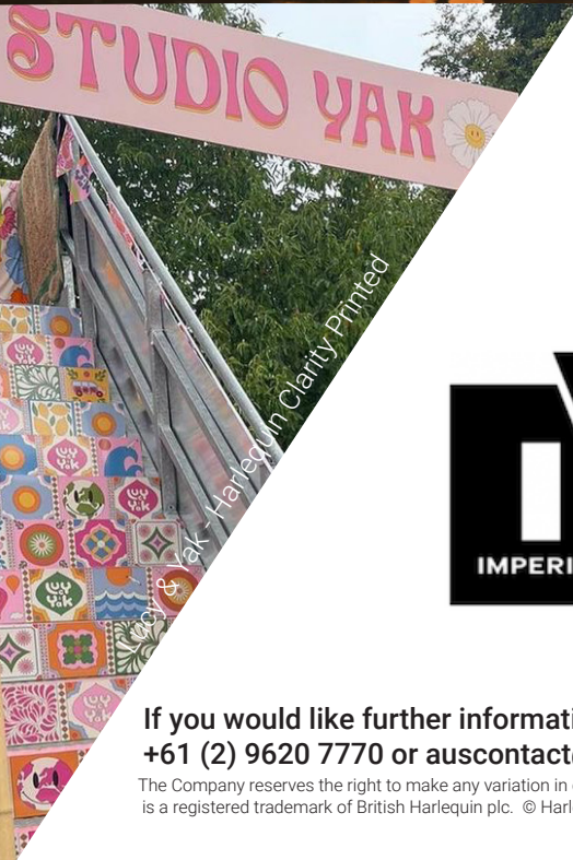
Yak - Harlequin Clarity Printed