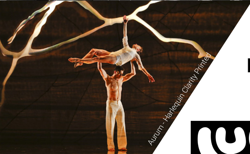
Aurum - Harlequin Clarity Printed