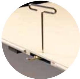
Harlequin's 'latch and lock' system